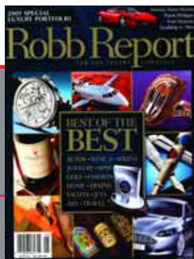
"Best of the Best" Robb Report Award three